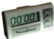
Digital timer Item 62350