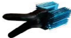
CP 60 Cooling pliers Item 62291