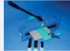
MFT 130 and MFT 250