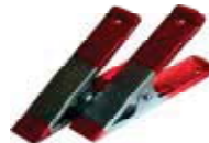
Clamps - red (pair) Item 62351